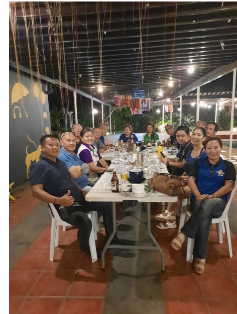
Sept. 15, 2022 Business and Fellowship Meeting at Hacienda Verde Pool Side Bry. Utap, Tacloban City.